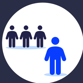
IMPAIRED SOCIAL INTERACTIONS