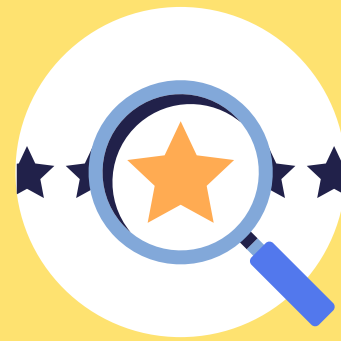
RESTRICTED RANGE OF INTERESTS