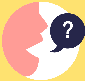
DELAYED AND DISORDERED LANGUAGE